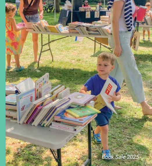
Book Sale 2025