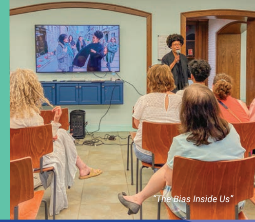
"The Bias Inside Us"