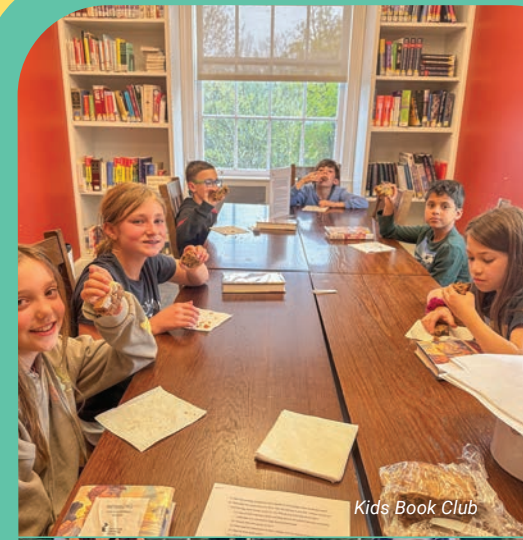
Kids Book Club

Bobcat of Mamaroneck Jerry's Post Road Market Learn'ique* Longfords Mobile Scoop Shoppe The Nurture Montessori of Rye Brook Osborn Retirement Community** Rye Pediatric Dentistry* Rye Reads Rye Subaru** Smart Playrooms* Starlight Dairy, Inc** Tig & Peach Walter's Hot Dogs